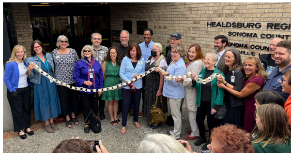
The Healdsburg Regional Library reopened on June 25 after a remodel. Check it out!